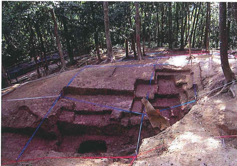
Figure 19. View west of the impact crater and western units (wet screen station in background). Units excavated during the 69th JFA are lined in red; units that contained possible osseous material are marked with blue.