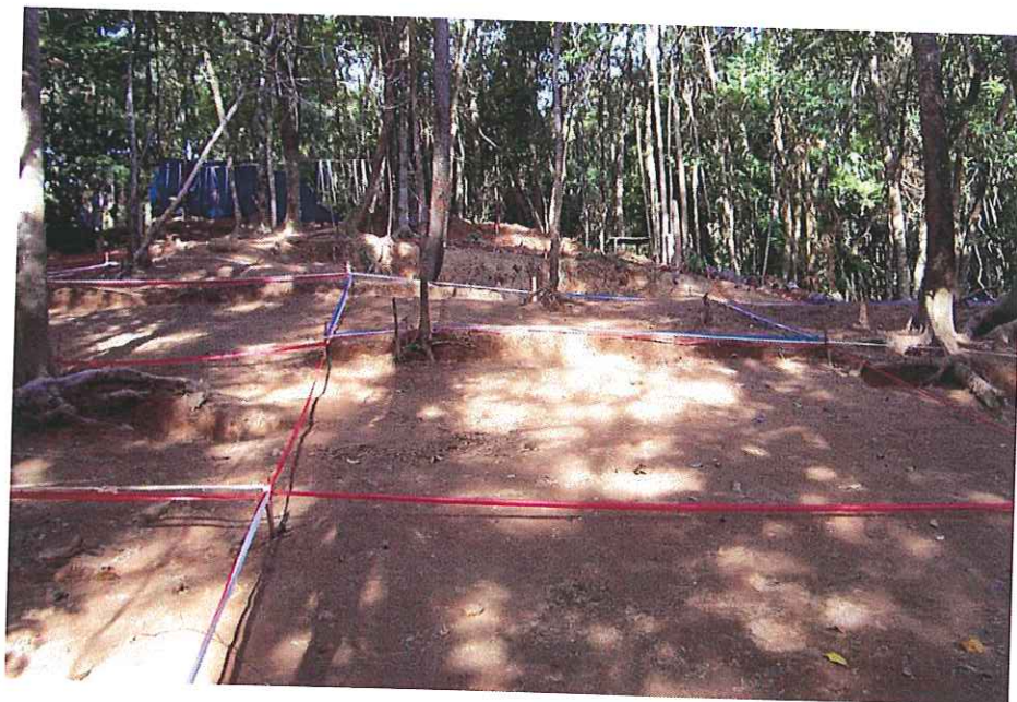
Figure 21. View east of units completed during the 69th and 70th JFAs.