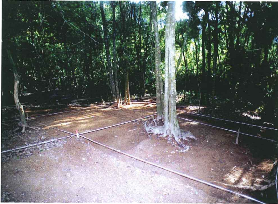
Figure 18. View southwest of westernmost units in Locus A after excavation during the 70th JFA.